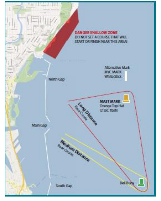
Windward - Leeward Course